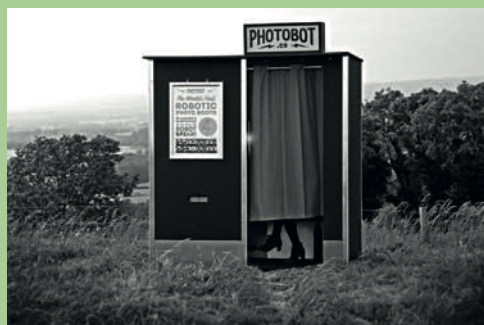
The Booky Photobooth

FANCY GETTING CREATIVE and having a go at drawing a self portrait with your favourite book? All materials provided. Just drop in.