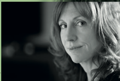
Polly Clark